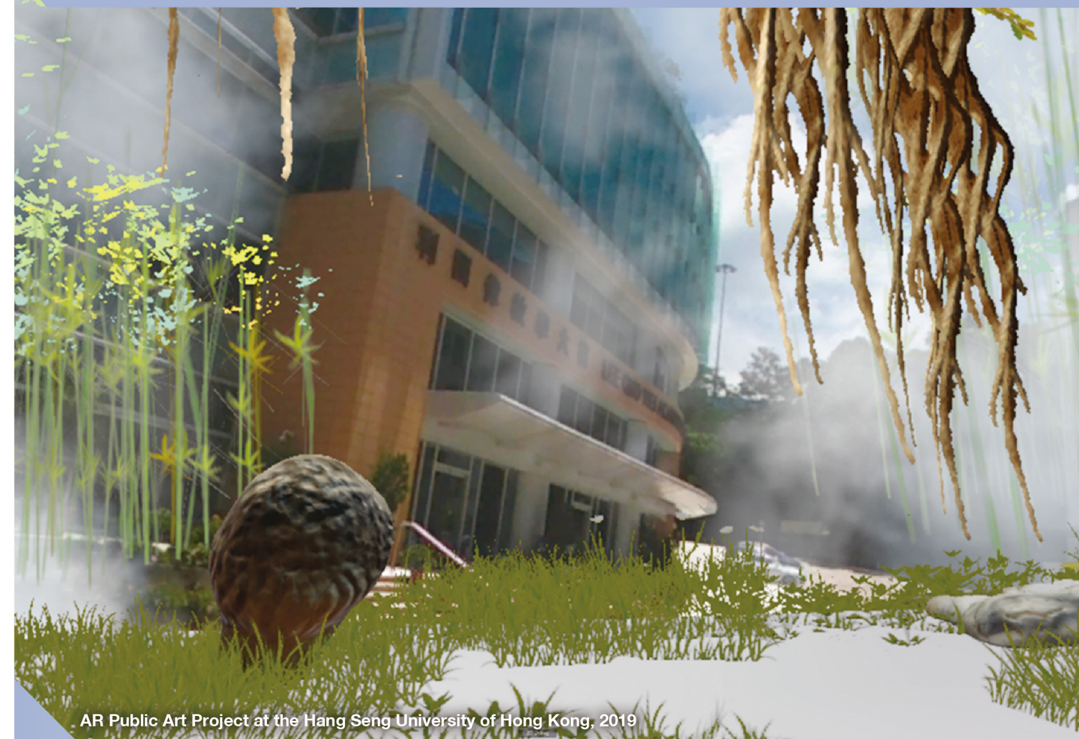
AR Public Art Project at the Hang Seng University of Hong Kong, 2019

The QF level: 5 The QR Registration number assigned by QR Authority: 20/000375/L5 The validity period of the relevant QR entry: 01/09/2020 To 31/08/2025