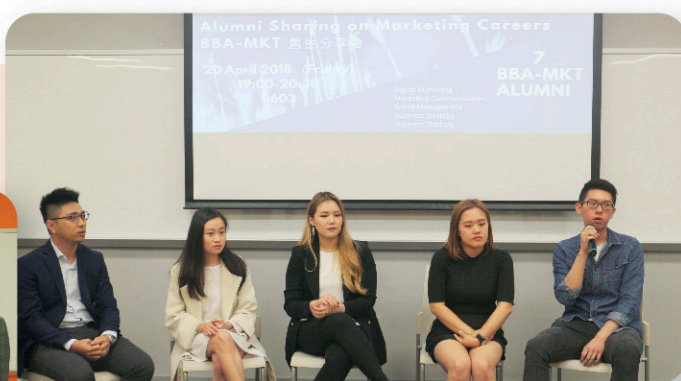
Alumni Sharing 校友分享