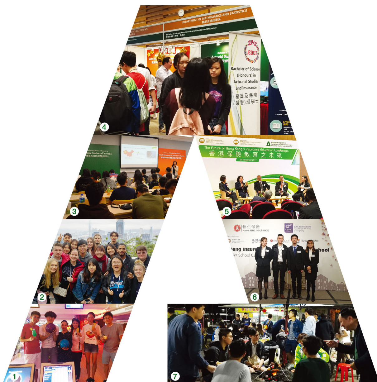
1 Mentorship Programme 師友計劃

由於保險業後勤專才需求殷切，本課程獲納入教育局的指定專業/界別課程資助計劃。經JUPAS申請入讀本課程的學生，每年可獲最高42,800港元學費資助。