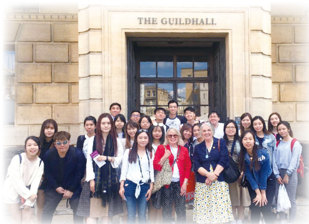
Students visit the UK to explore the historic city of London