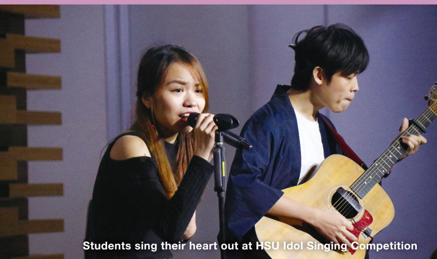
Students sing their heart out at HSU Idol Singing Competition

The English Language Centre (ELC) aims to help students enhance their English language skills. We provide tutoring services, English-language workshops, and cultural literacy activities, as well as a computer laboratory, a consultation/study room, and a variety of multimedia self-access materials. The workshops cover topics ranging from practical use of English to cultural lessons about various English-speaking societies. Additional activities include singing contests, reading groups, dramatic duologue competitions, movie nights, and seminars by guest speakers. Each of these opportunities allows students to brush up on their language proficiency and to broaden their cultural horizons.