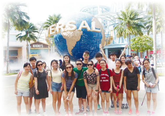
Summer breeze hits BA in English students in Singapore

The University offers exchange opportunities to students to increase their exposure in diverse cultures and cultivate their identity as global citizens. The Department also offers short-term summer exchange programmes and cultural tours around the world.