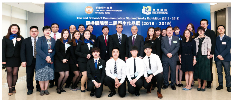
Group photo of the 2nd School of Communication Student Works Exhibition (2018/19) 傳播學院第二屆學生作品展(2018/19)大合照