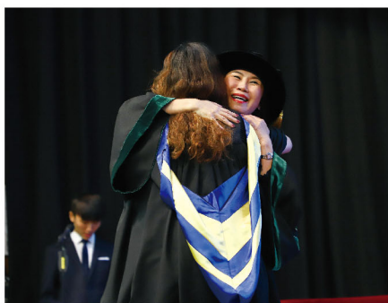
Graduates took photo with the Dean of School of Communication at the graduation ceremony. 畢業生與傳播學院院長於畢業禮合照。