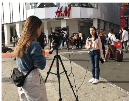
Students conducting interviews in Taipei 學生於台北街頭進行採訪。