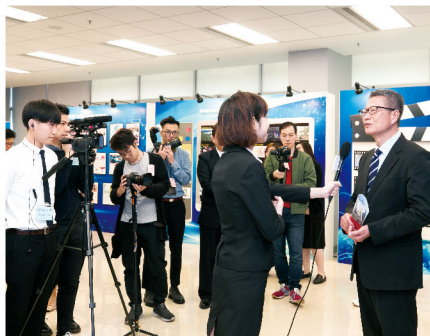
Mr Chan Mo Po, the Financial Secretary of HKSAR, was interviewed by BJC students in the 2nd School of Communication Student Works Exhibition (2018/19). 陳茂波財政司司長於傳播學院第二屆學生作品展(2018/19)接受傳播學院的同學訪問。