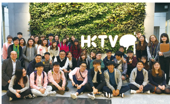
Students visited HKTVMall Media Production Centre. 學生參觀香港電視HKTVMall媒體製作中心。