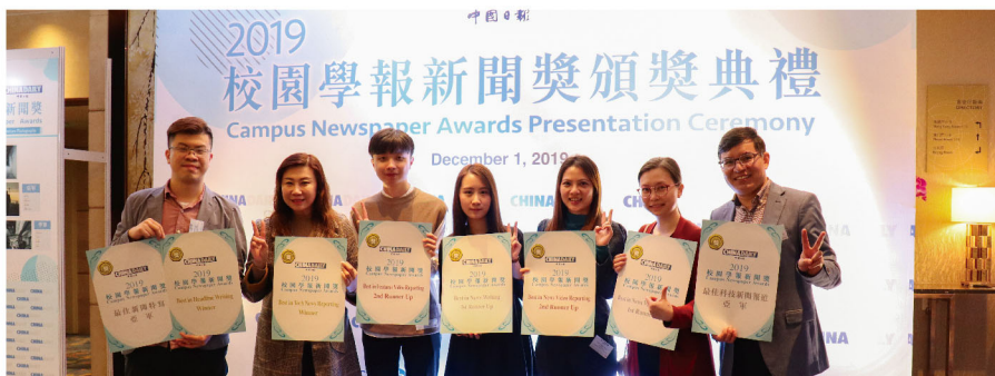
Students were awarded in the Campus Newspaper Competition. 同學於校園學報比賽獲得多個大獎。