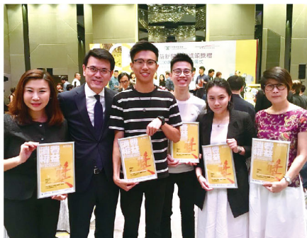
Students who were awarded in the 18th Consumer Rights Reporting Awards took photo with the Secretary for Commerce and Economic Development, Mr Edward Yau Tang Wah (2nd from left). 於第18屆消費權益新聞報道獎比賽獲獎的同學與商務及經濟發展局局長邱騰華先生(左二)合照。