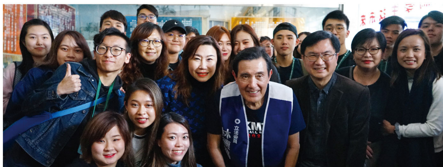
SCOM teachers and students took photo with Taiwan Former President Ma Ying-jeou in the 2020 Taiwan Election Study Tour. 傳播學院師生於2020年台灣總統副總統及立法委員選舉考察團中與台灣前總統馬英九先生合照。