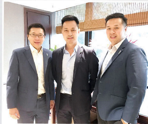
Donors of Hong Kong Young Chief Officers' Association Scholarship for BBA (Hons) in GBM Students