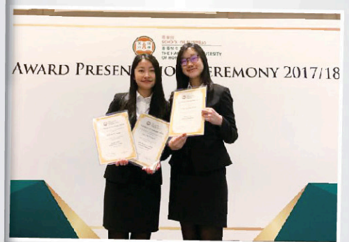
Dean's List Students