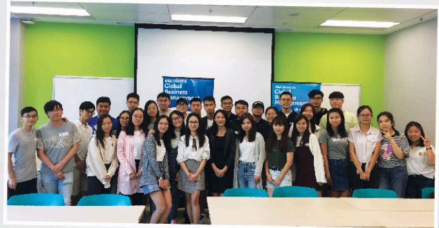
Global Bravo Meet