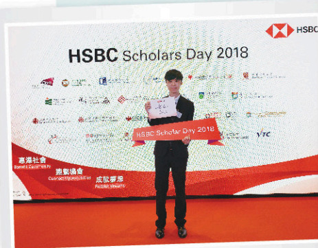
HSBC Scholarship Recipient

就讀本系的學生成績非凡，奪得不少聯校比賽獎項及卓越獎學金。本課程特別設立獎學金予表現優秀的同學。學生可參加本系及大學舉辦之各類課外活動以結合理論和實踐。過往校內曾舉辦G20模擬峰會、精英網絡學長計劃、專業導師計劃、知創空間體驗及原型製作工作坊。