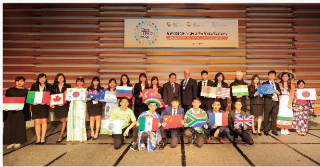
G20 Summit Simulation