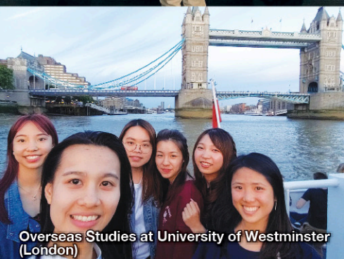
Overseas Studies at University of Westminster (London)