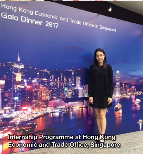
Internship Programme at Hong Kong Economic and Trade Office, Singapore