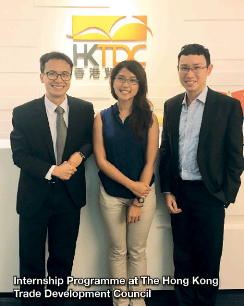
Internship Programme at The Hong Kong Trade Development Council