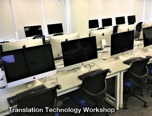
Translation Technology Workshop