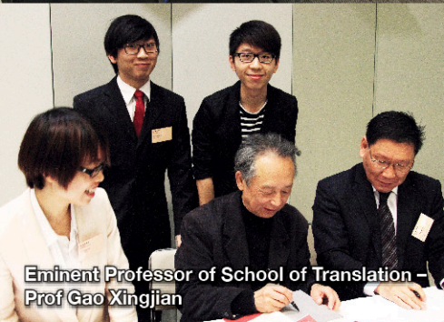
Eminent Professor of School of Translation – Prof Gao Xingjian